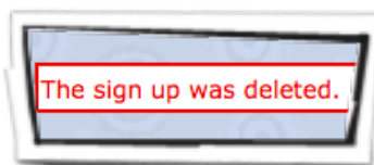
figure 6: Great job!